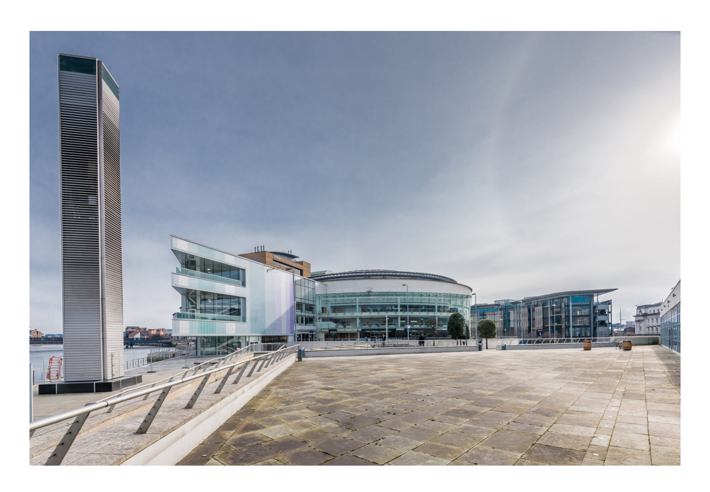
Read also Key speakers unveiled for EmTech Europe 2021

Dr Türeci played a crucial role in the clinical development of "Project Lightspeed" and helped lead the development of mRNA-based vaccines and cancer antigens as well as immunotherapies which are currently in clinical development.