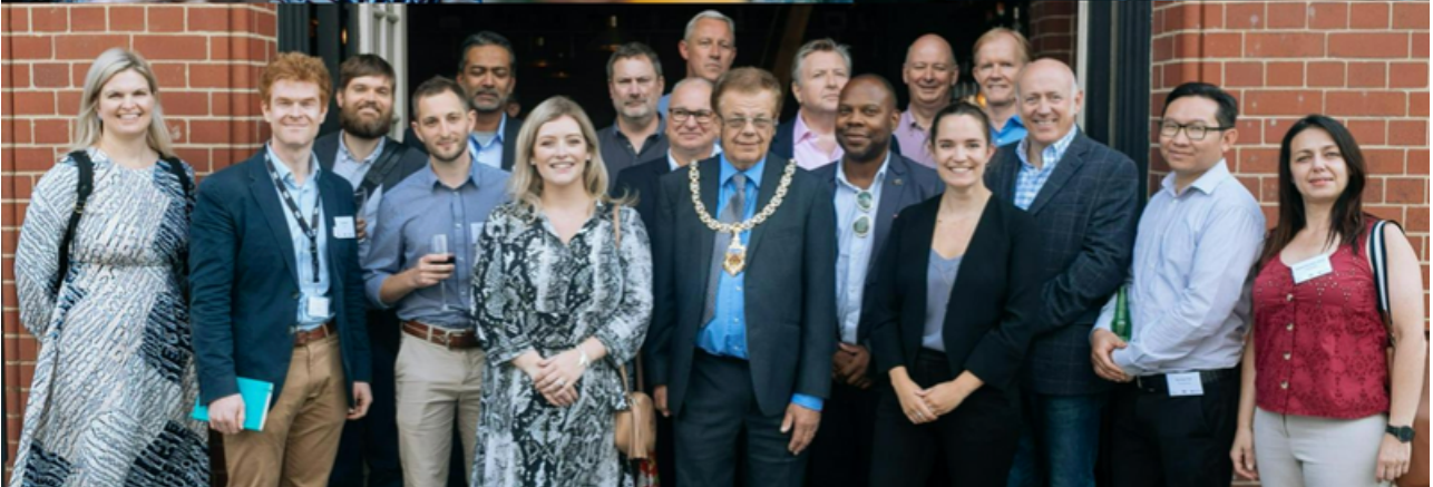
Image: Welcome drinks for a previous Wayra/NCSC cohort.