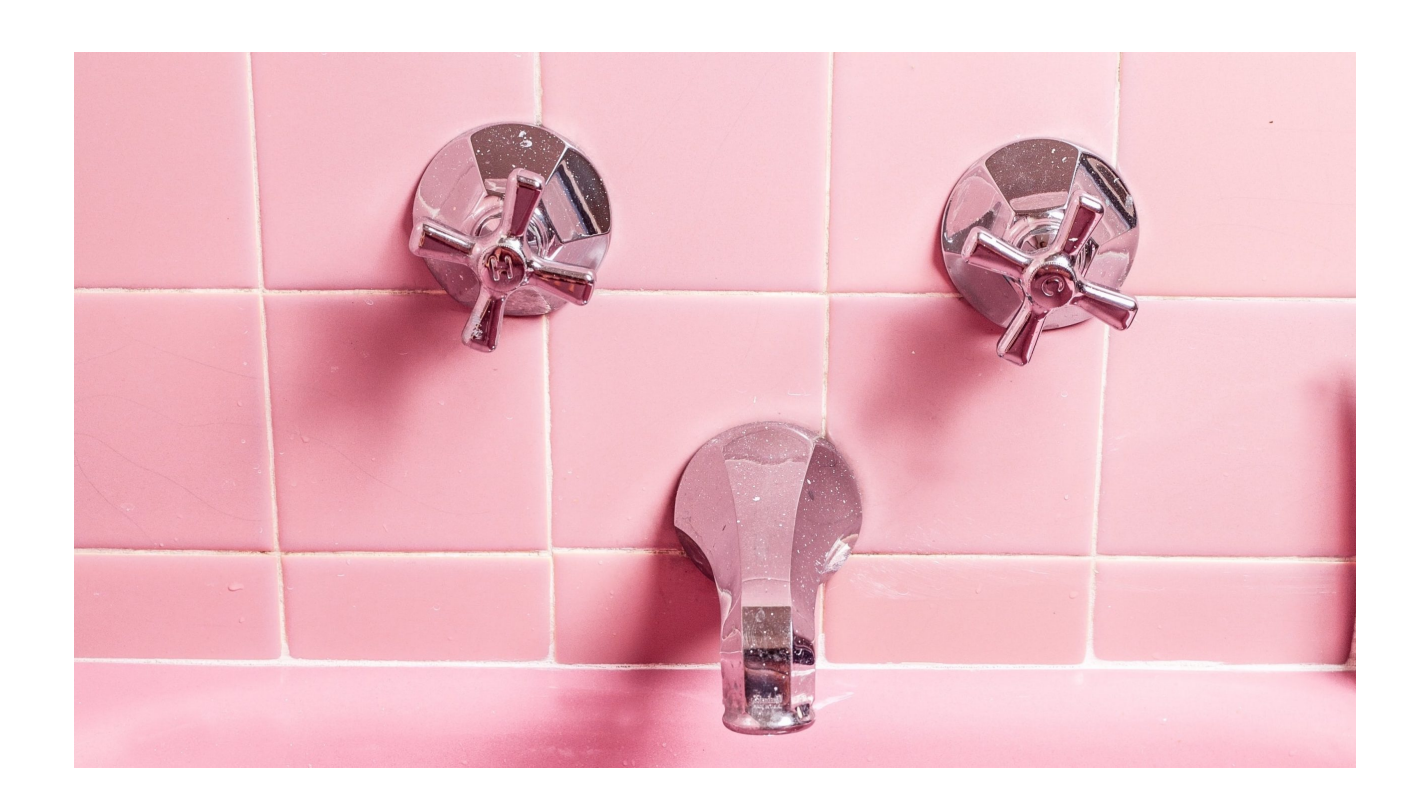
Read also Plastic-free pits

Maybe your loved one wasn't quite ready for a lockdown puppy, but has taken on the responsibility of caring for a lockdown plant - or seven. How about a virtual workshop on how best to take care of it, to ensure it continues to thrive even after the days of working from home are over? The Sill is a US company, and it would be ridiculous to send a solitary cheese plant over the Atlantic Ocean, but have a look at their online workshops <a href="here">here</a>. The two post Christmas focus on 'Winter Plant Care' and 'Humidity 101'.