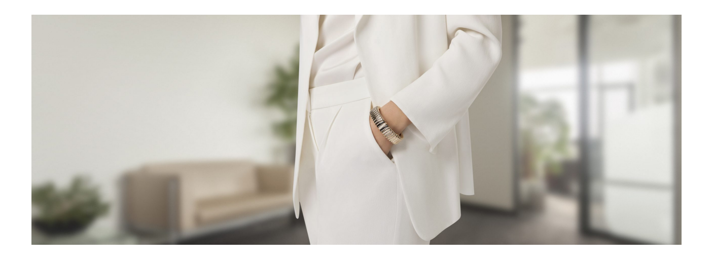
Read also Wearables need a makeover: Interview with Dmitriy Poltavtsev, Smartline founder

If any of these presentations are of interest you can contact the NOTWICS team via the button under each video.