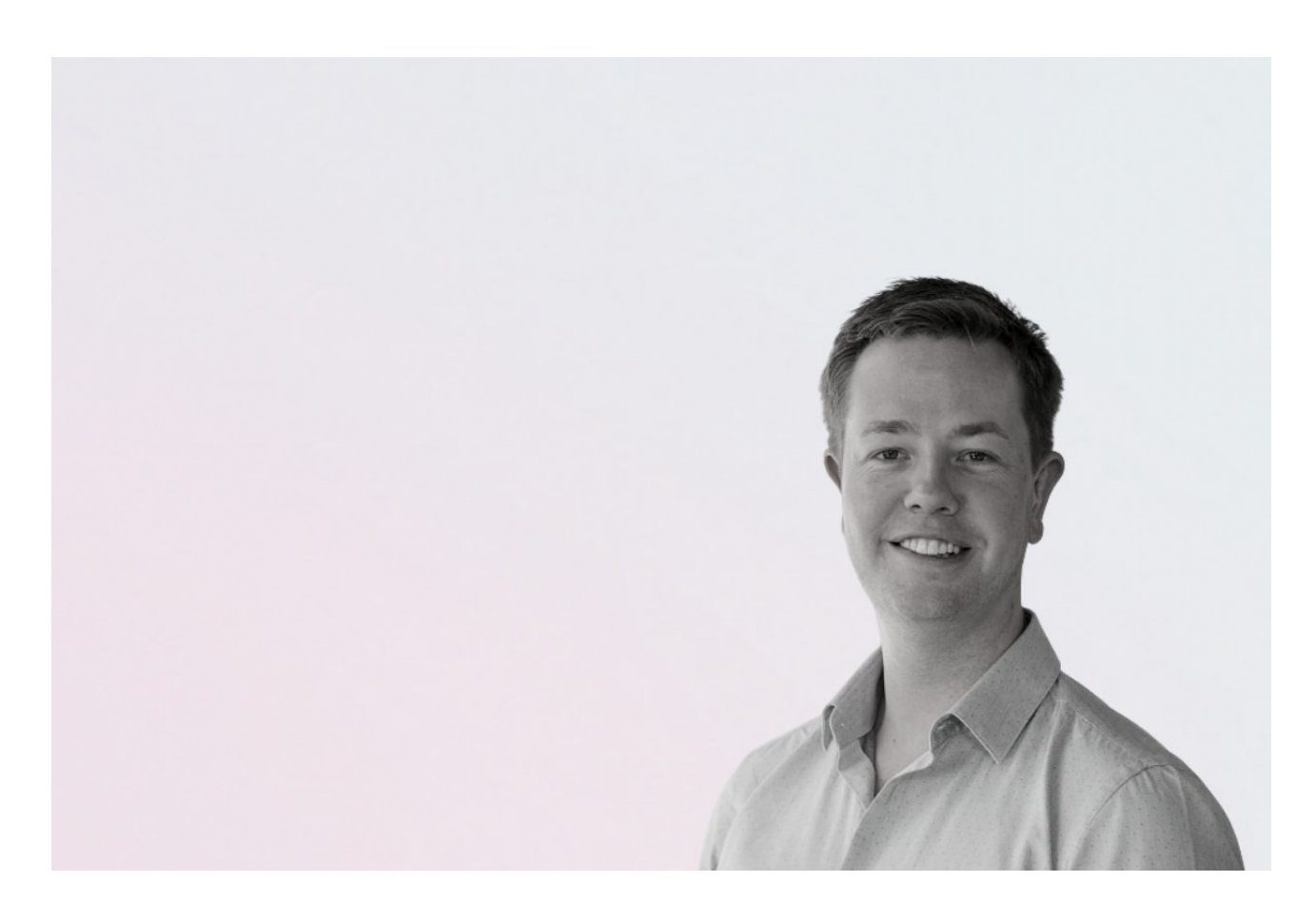
À lire aussi Fueling the growth of early stage companies with Fuel Ventures #QVCS

Led by Fuel Ventures and 360 Capital Partners, the round notably included investment from Matt Robinso, cofounder of GoCardless and Nested, and Carlos Gonzales, COO at GoCardless.