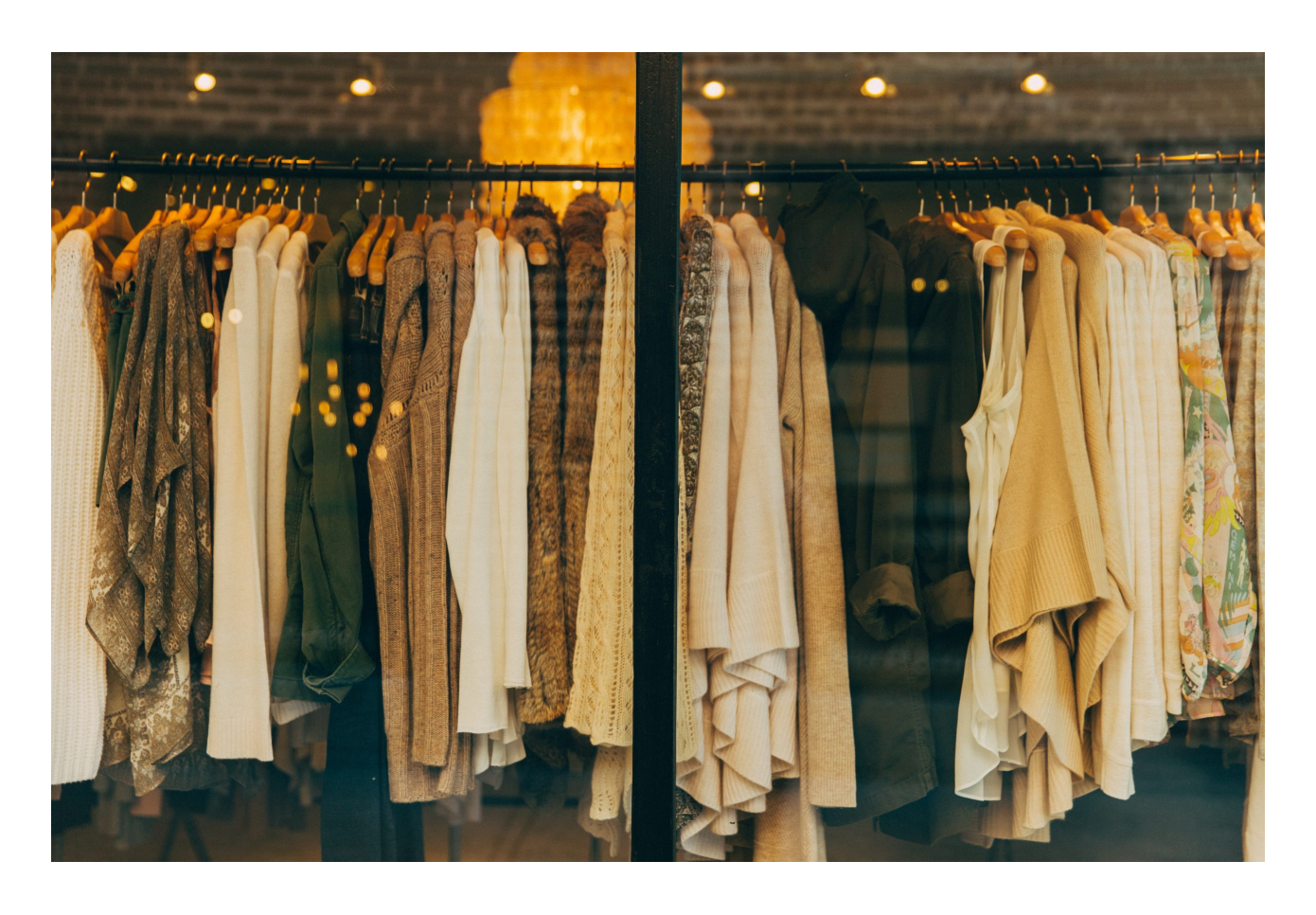
À lire aussi

Read more about Purple Dot's 'worth-the-wait' model in this article: