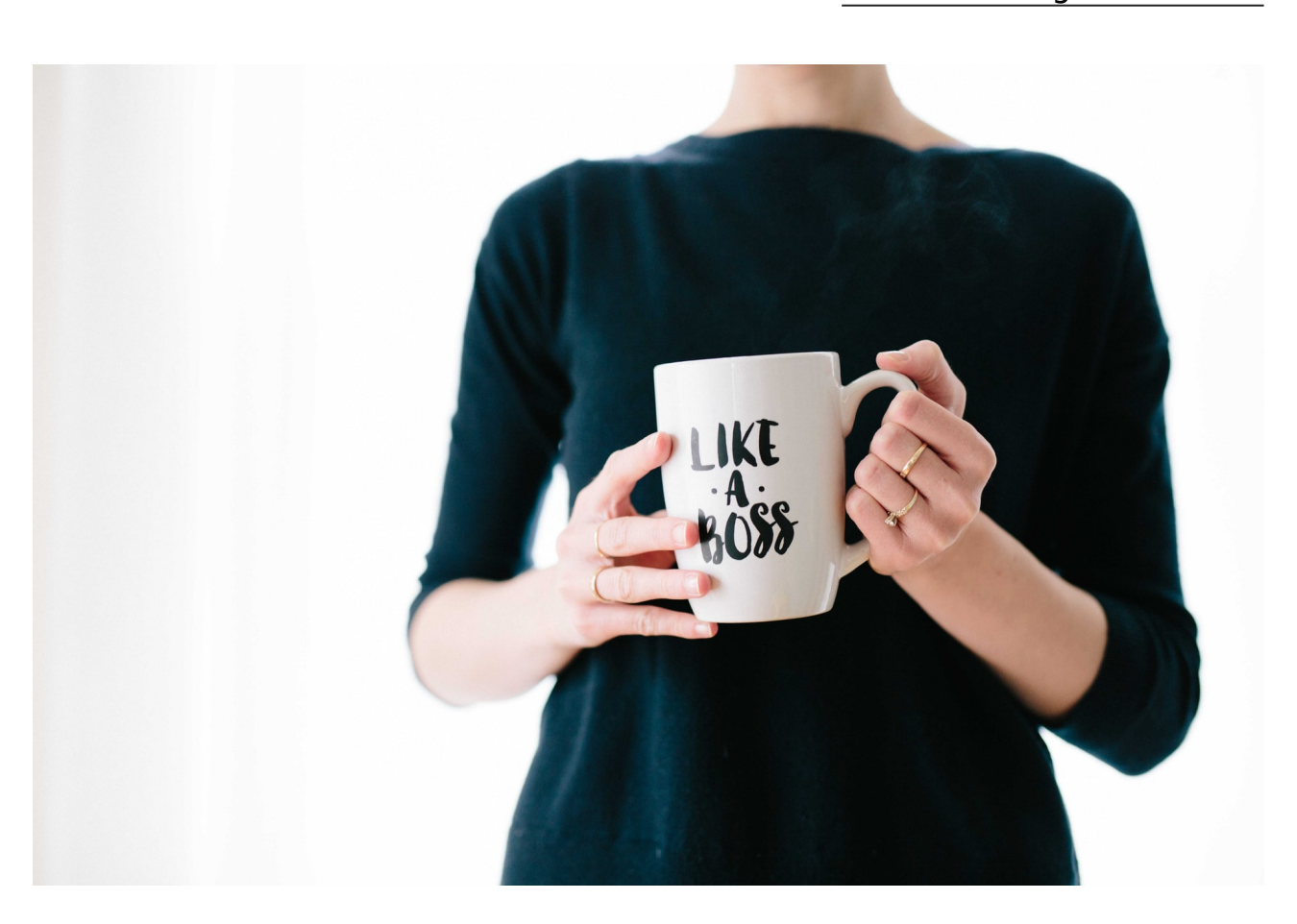
À lire aussi Are you a female founder struggling to receive funding? You're