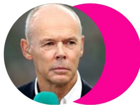
Sir Clive Woodward

World Cup winning England Rugby Coach & London 2012 Team GB Director of Sport